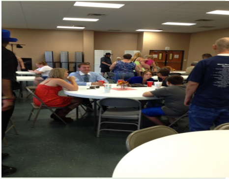
2010 Anniversary Celebration

We will be honoring our members at this annual event.