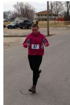
2014 Ability 5K Walk, Run, & Roll